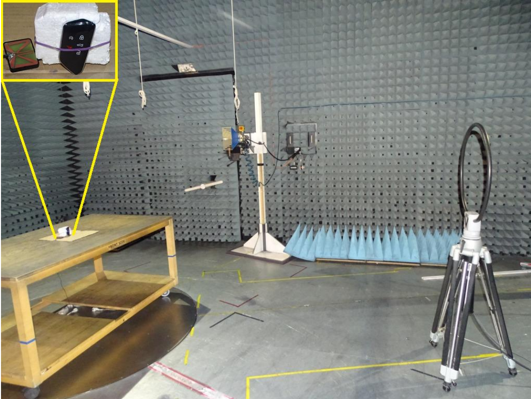
Photo 1: Test setup for radiated emissions measurements in semi-anechoic chamber (9 kHz to 30 MHz), rear side view, 3 m measurement distance