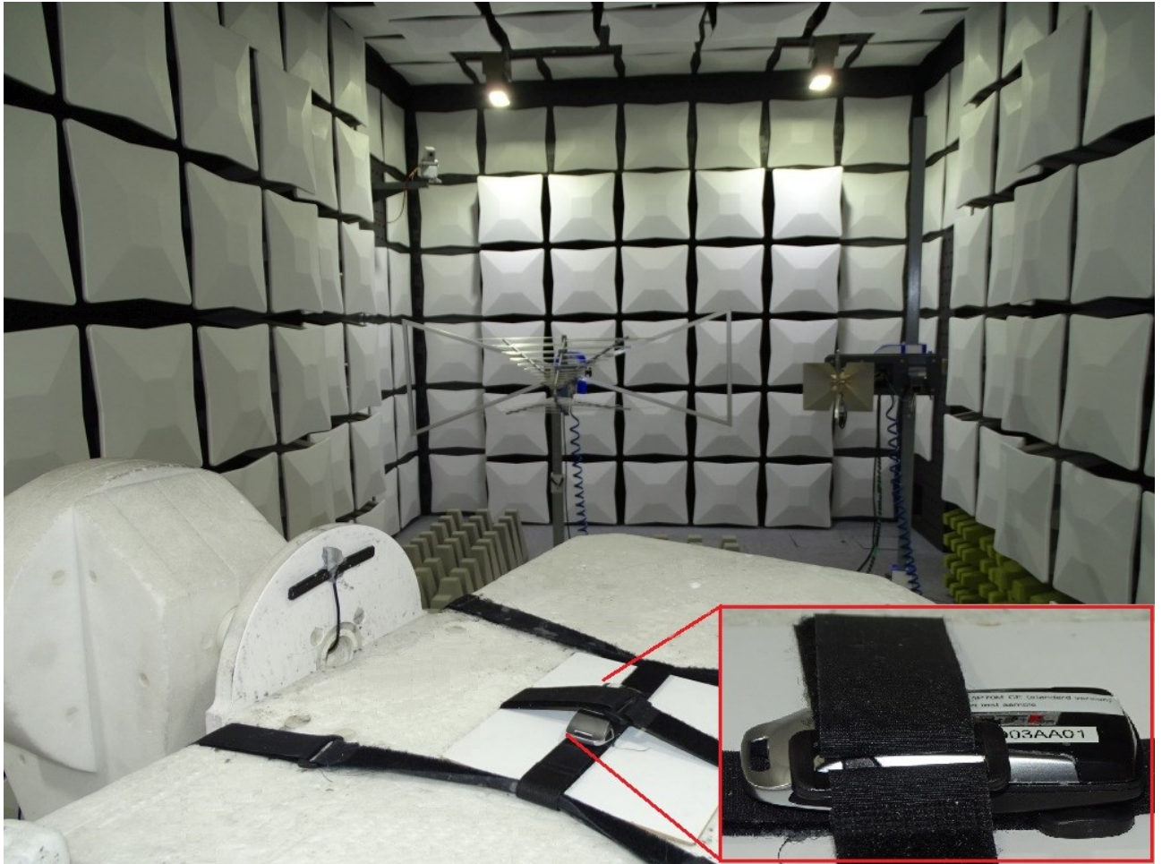
Photo 3: Test setup for radiated measurements (Enclosure, fully-anechoic chamber, 1-6 GHz intentional radiator §15, ANSI C63.10)