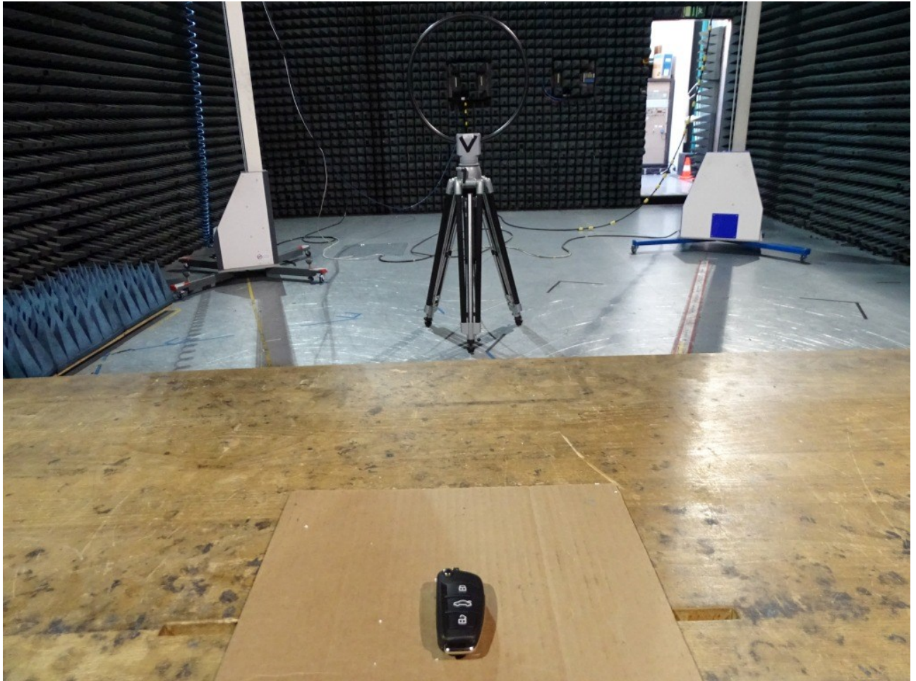
Photo 1: Test setup for radiated measurements (Enclosure, below 30 MHz, intentional radiator §15.209, ANSI C63.10)