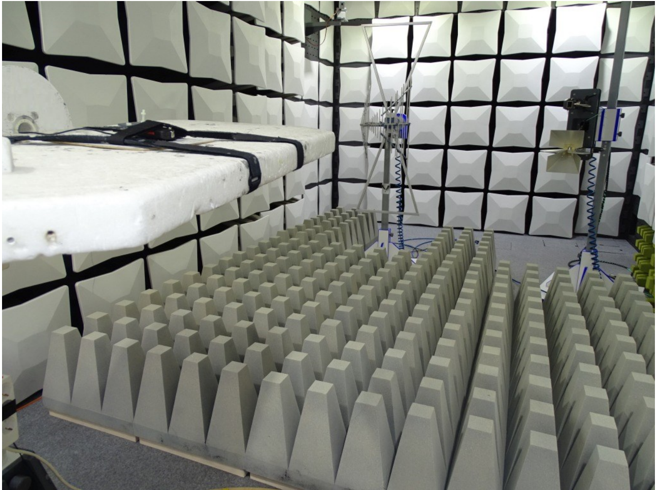
Photo 3: Test setup for radiated measurements (Enclosure, fully-anechoic chamber, 1-6 GHz intentional radiator §15, ANSI C63.10)