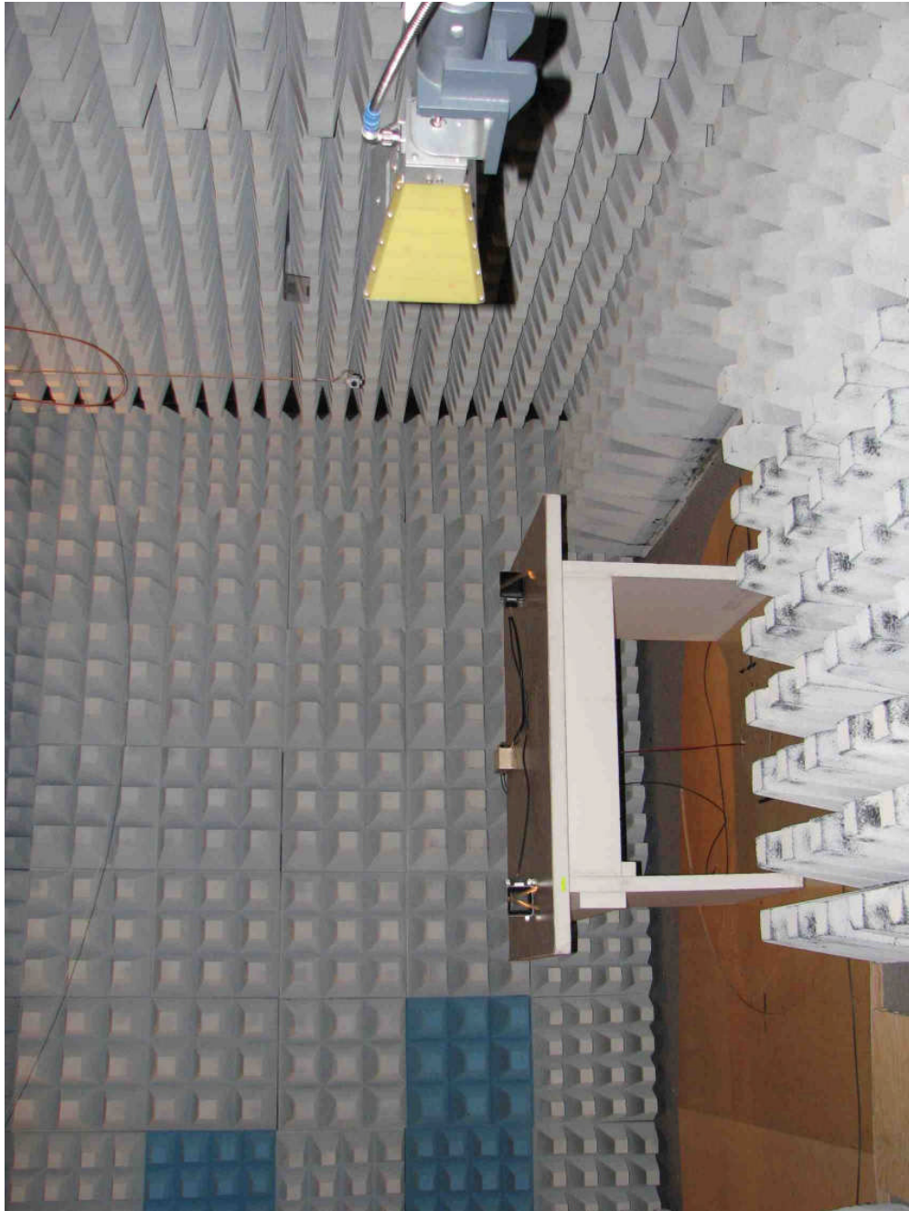
72572emi4.JPG: Test set-up radiated E-Field

Annex A of Test Report R72572_VW_FCC EUT: LCDAS Lane Change Decision Aid System Manufacturer: Hella KGaA Hueck & Co.