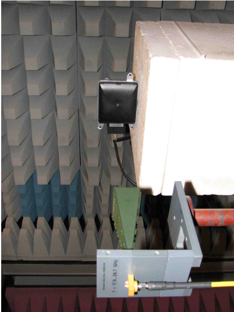
72572emi10.JPG: Test set-up radiated E-Field

Annex A of Test Report R72572_VW_FCC EUT: LCDAS Lane Change Decision Aid System Manufacturer: Hella KGaA Hueck & Co.