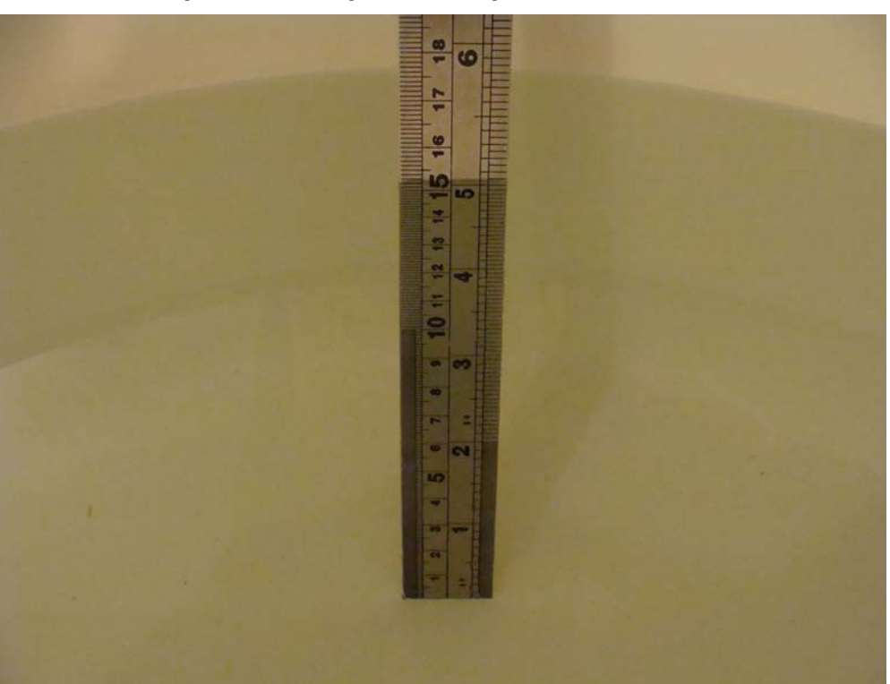
Depth of the liquid in the phantom-Zoom In

Note: The positions used in the measurements were according to IEEE 1528-2013.