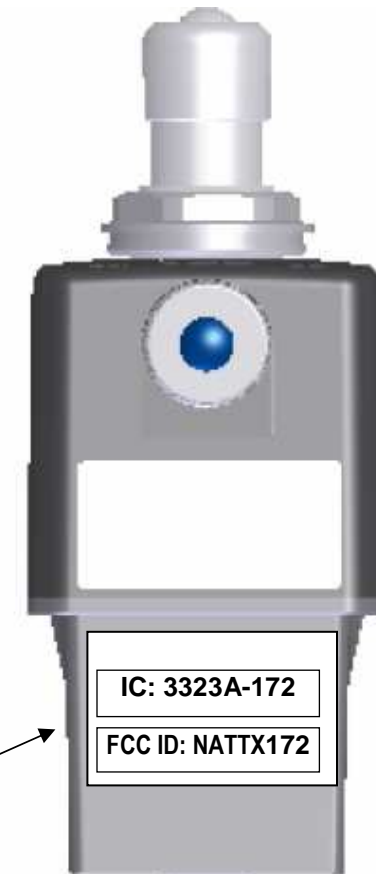
Regulatory Label position