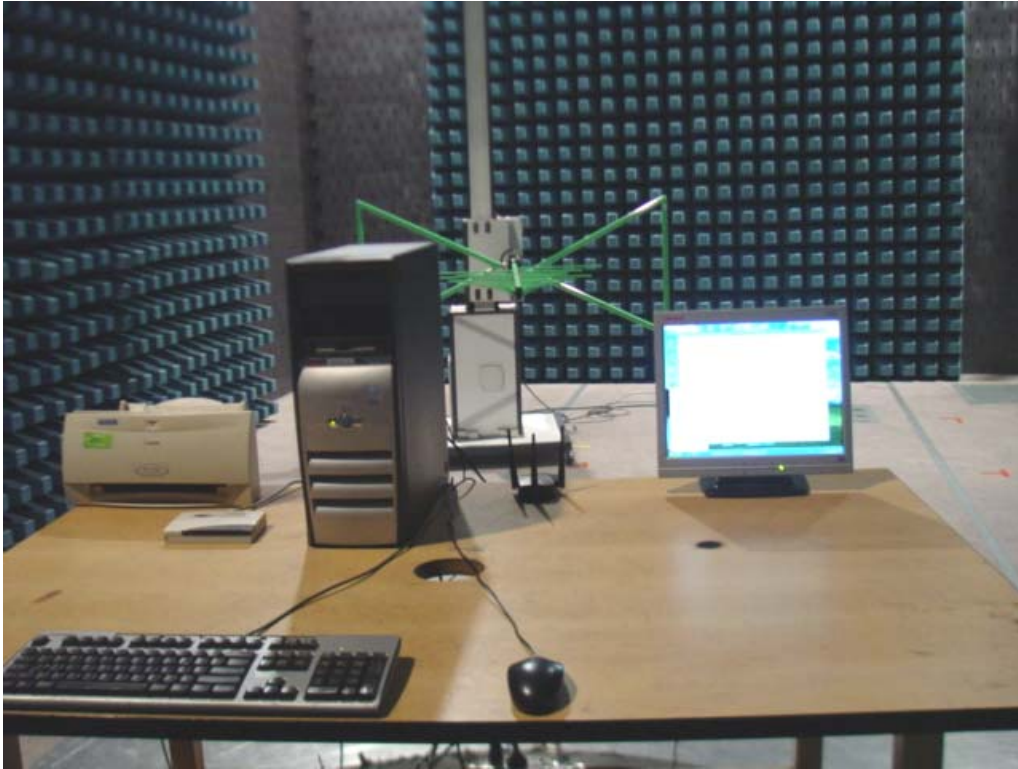
Photo 4 Radiated Emission Test