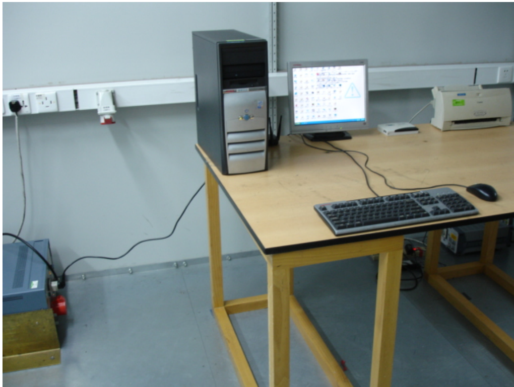
Photo 2 Conducted Emission Test