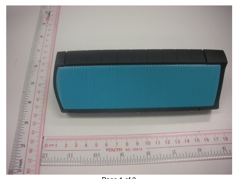
Page 1 of 3 TÜV SÜD Hong Kong Ltd. 3/F, West Wing, Phase 2, 10 Science Park West Avenue, Hong Kong Science Park, Shatin, Hong Kong