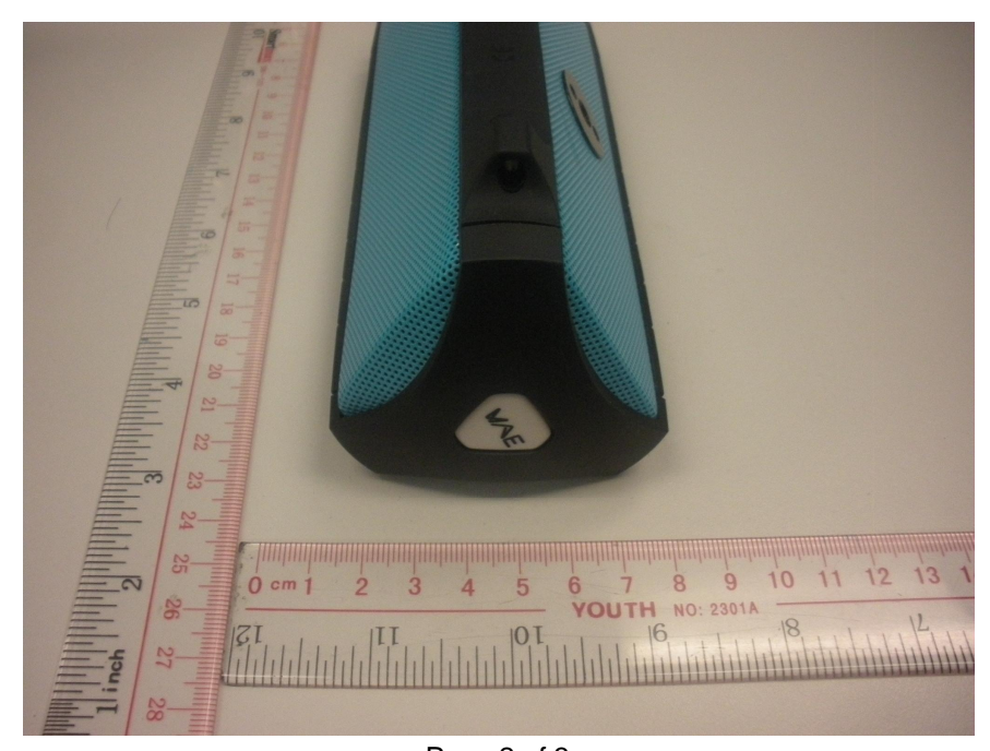
Page 2 of 3 TÜV SÜD Hong Kong Ltd. 3/F, West Wing, Phase 2, 10 Science Park West Avenue, Hong Kong Science Park, Shatin, Hong Kong