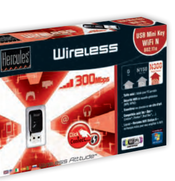
Hercules Wireless N300 USB Mini (HWNUm-300)