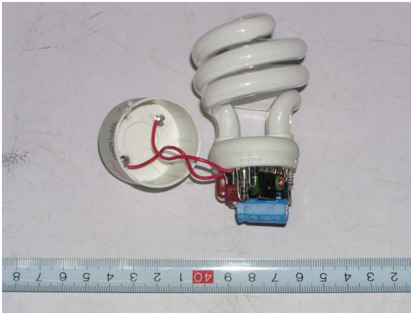
EUT-PCB Front View