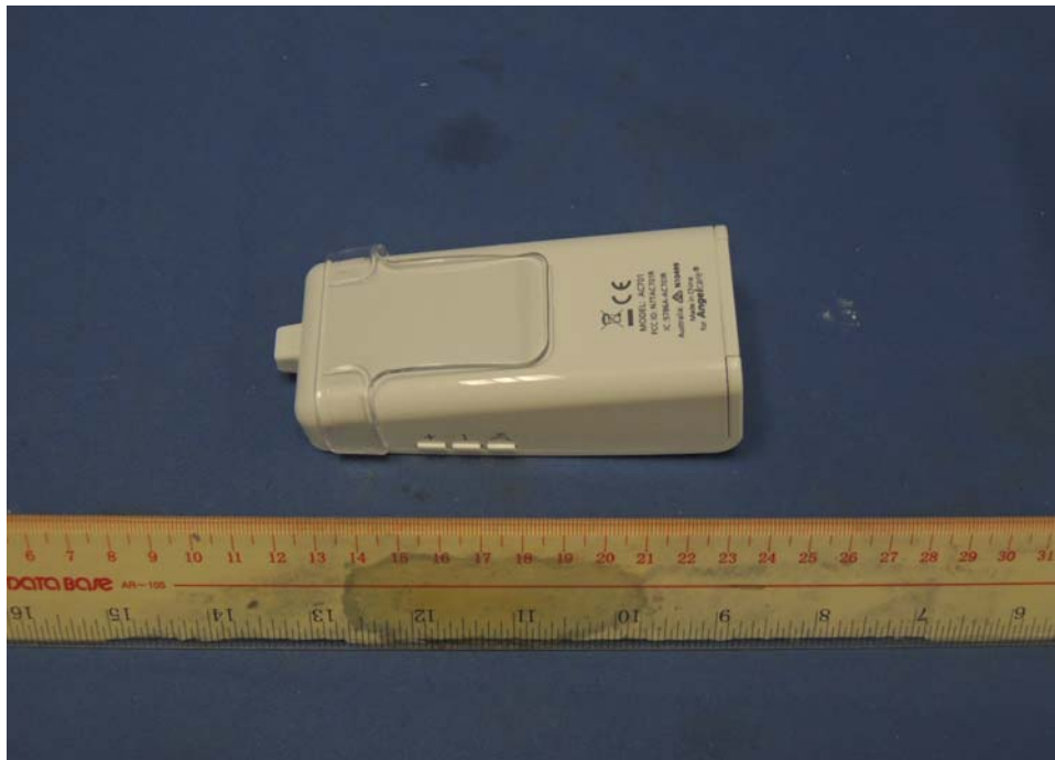
Figure 2 – Parent Unit back view