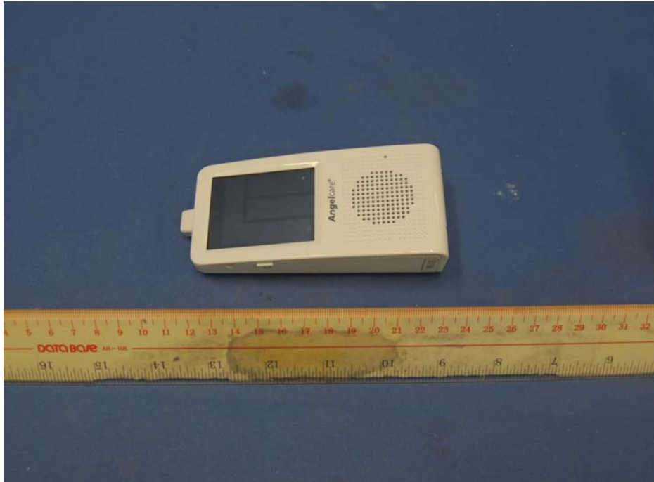
Figure 1 – Parent Unit front view