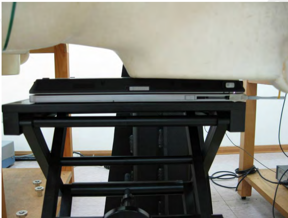
Fig.4 Configuration 1

Unless otherwise stated the results shown in this test report refer only to the sample(s) tested and such sample(s) are retained for 90 days only. 除非另有說明，此報告結果僅對測試之樣品負責，同時此樣品僅保留90天。本報告未經本公司書面許可，不可部份複製。