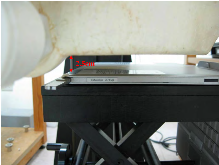
Fig.5 Configuration 7