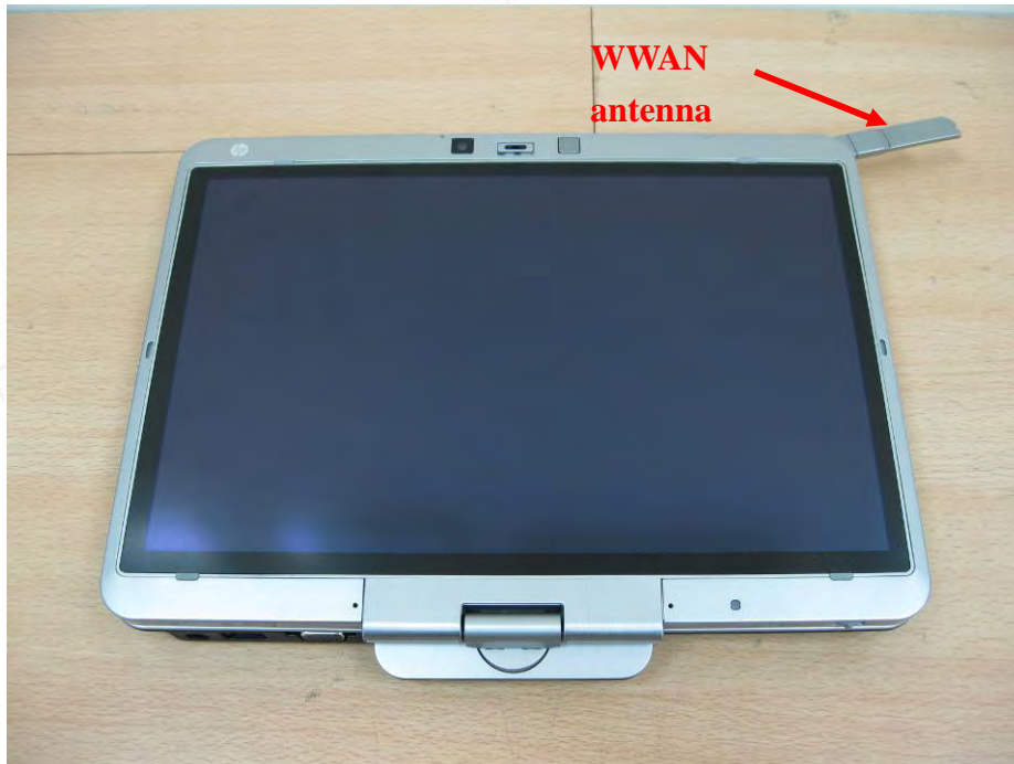
Fig.3 Antenna position of EUT