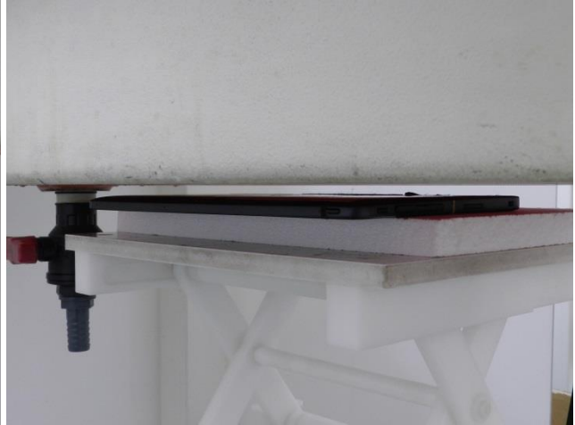
Bottom Face, Test Separation 10mm