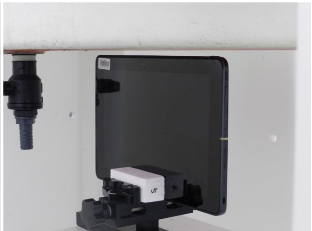
Edge1, Test Separation 10mm