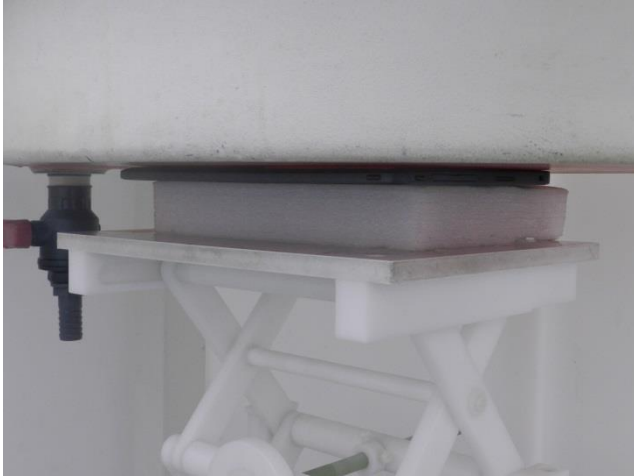
Bottom Face, Test Separation 0 cm