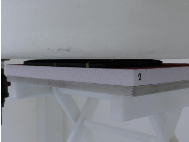
Bottom Face, Test Separation 0 mm