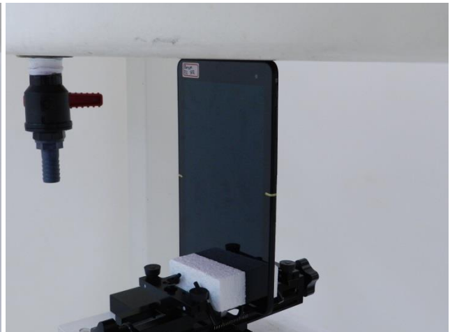
Edge1, Test Separation 0 mm