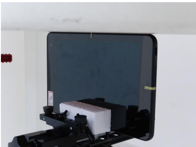
Edge2, Test Separation 0 mm