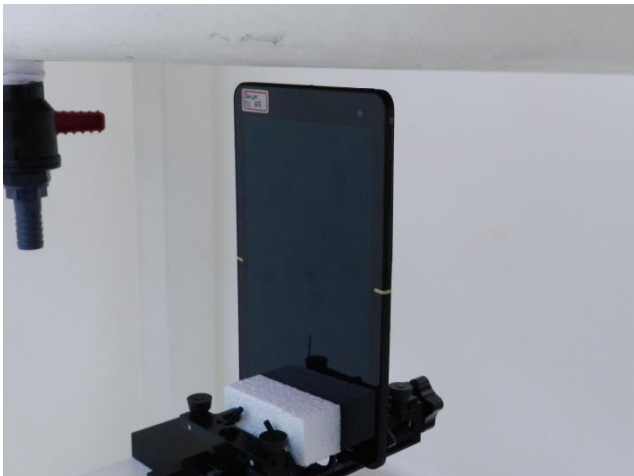
Edge1, Test Separation 13 mm