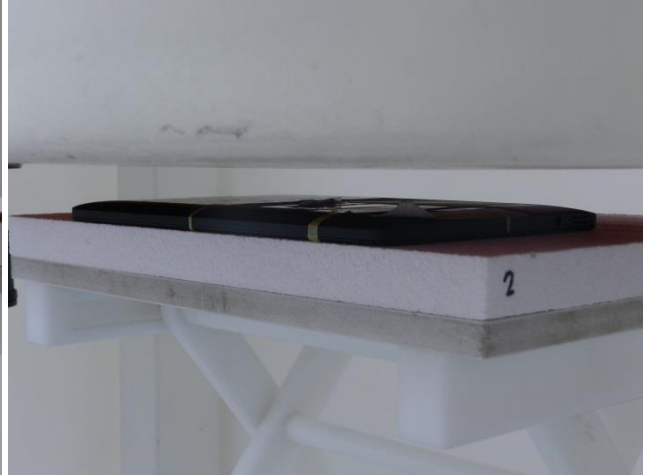
Bottom Face, Test Separation 15 mm