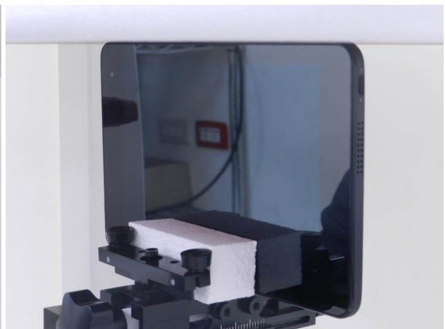
Edge4, Test Separation 0 mm