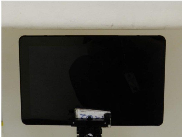
Edge1, Test Separation 1.1 cm