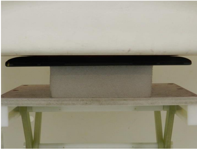
Bottom Face, Test Separation 0 cm