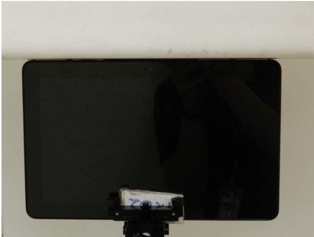
Edge1, Test Separation 0 cm