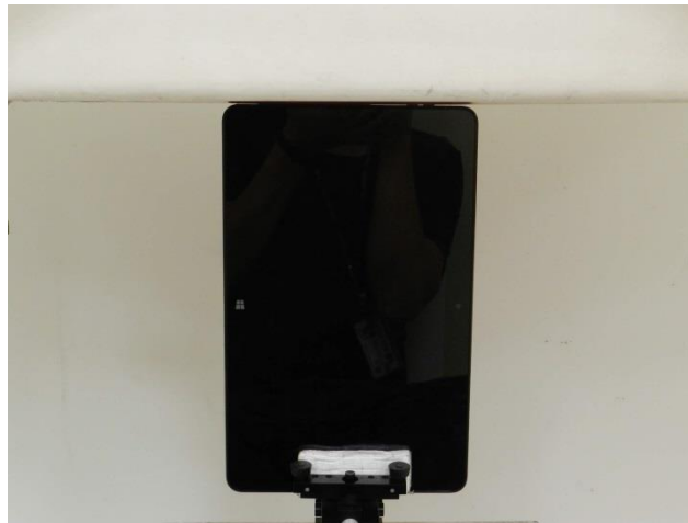
Edge4, Test Separation 0 cm