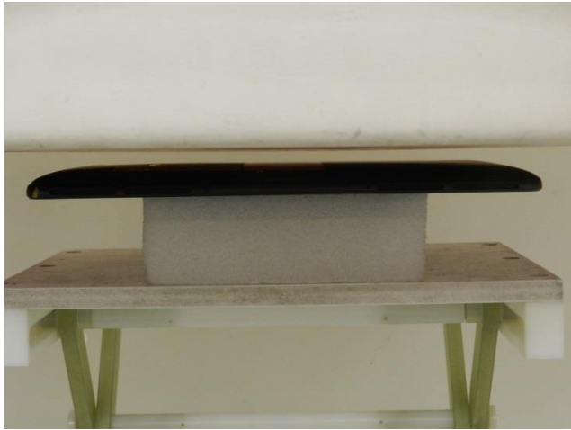
Bottom Face, Test Separation 1 cm