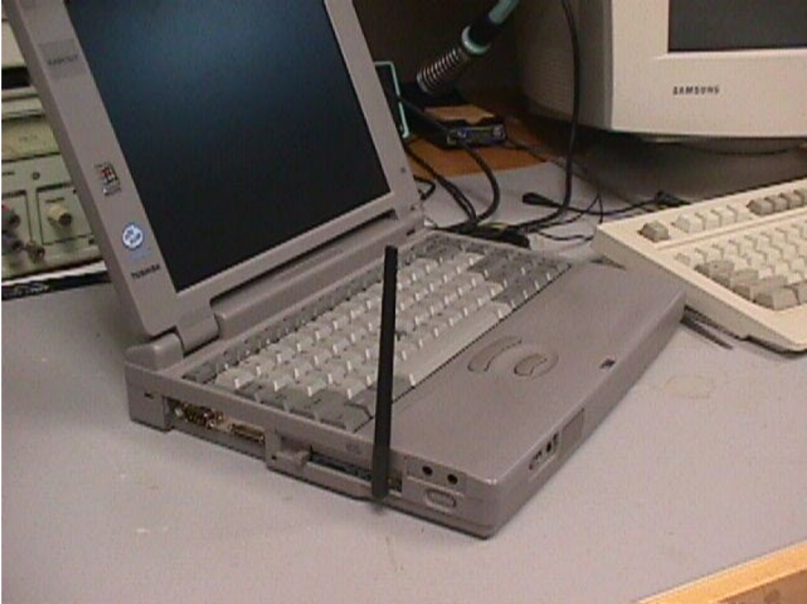
Figure 4: PCMCIA Card Prospective View – Shows card inside laptop