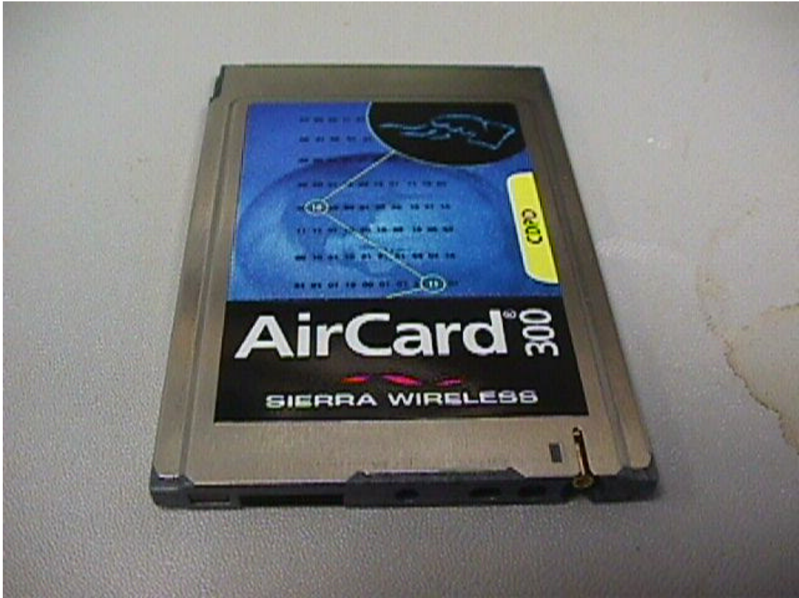
Figure 1: PCMCIA Card Edge – Outside edge showing antenna connector