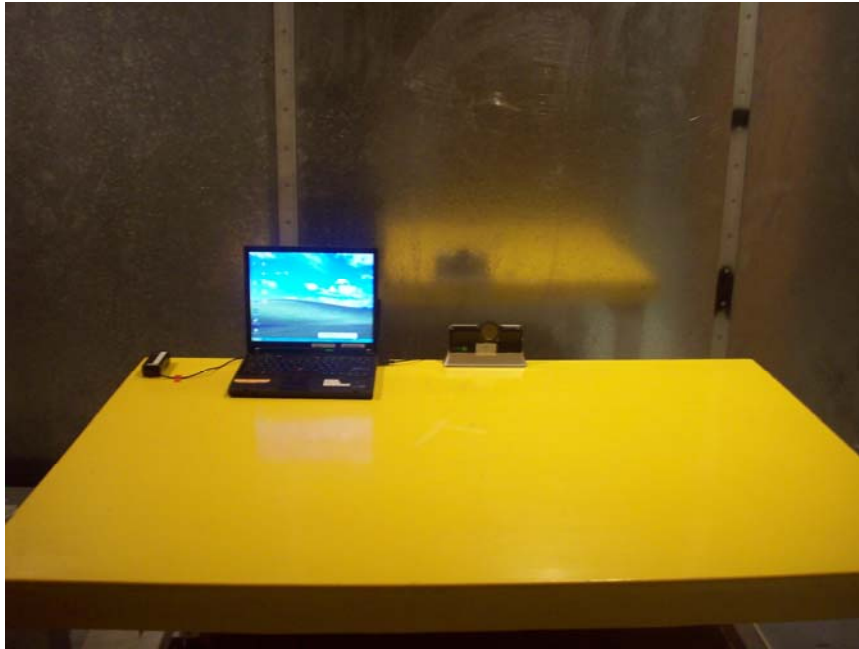
LINE CONDUCTED FRONT PHOTO