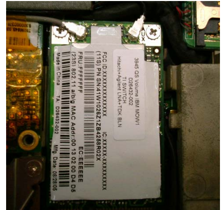
PCI-express type WLAN card

The certification label is stuck on the top side of the applying transmitter device, and IC Certification Number and FCC ID are visible when the keyboard assembly are removed.