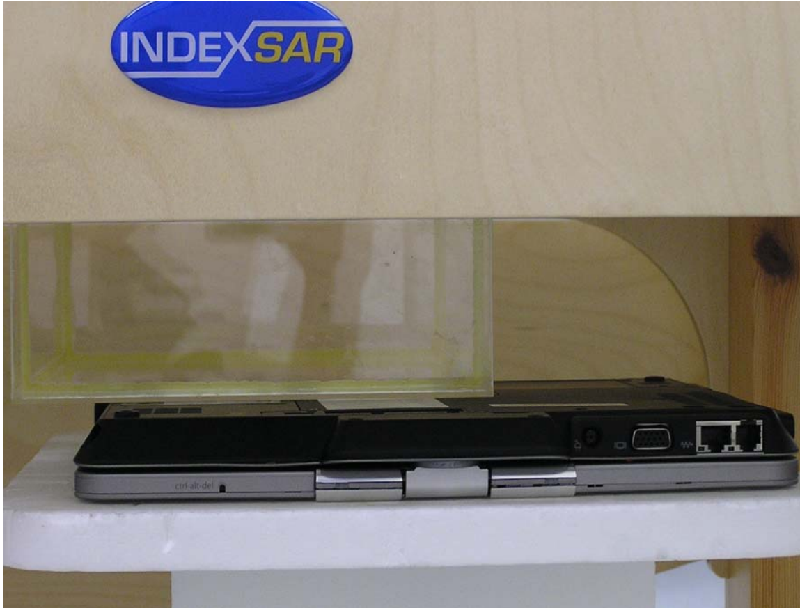
Photo 1. Lap A Main WLAN Antenna Position