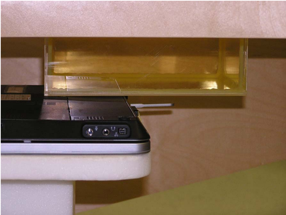
Photo 2. Lap B Main WWAN and WLAN Antennas Position