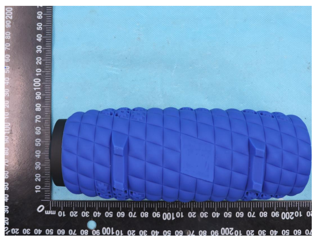
Shenzhen STS Test Services Co., Ltd.

1/F., Building B, Zhuoke Science Park, No.190, Chongqing Road, Fuyong Street, Bao'an District, Shenzhen, Guangdong, China Tel: 0755-36886288 Fax: 0755-36886277 Http://www.stsapp.com E-mail: sts@stsapp.com