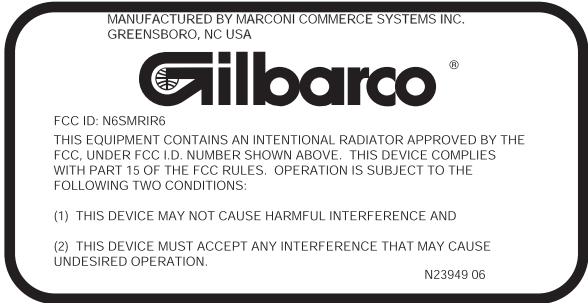
FCC LABEL attached to the inner column (3" x 1.4")