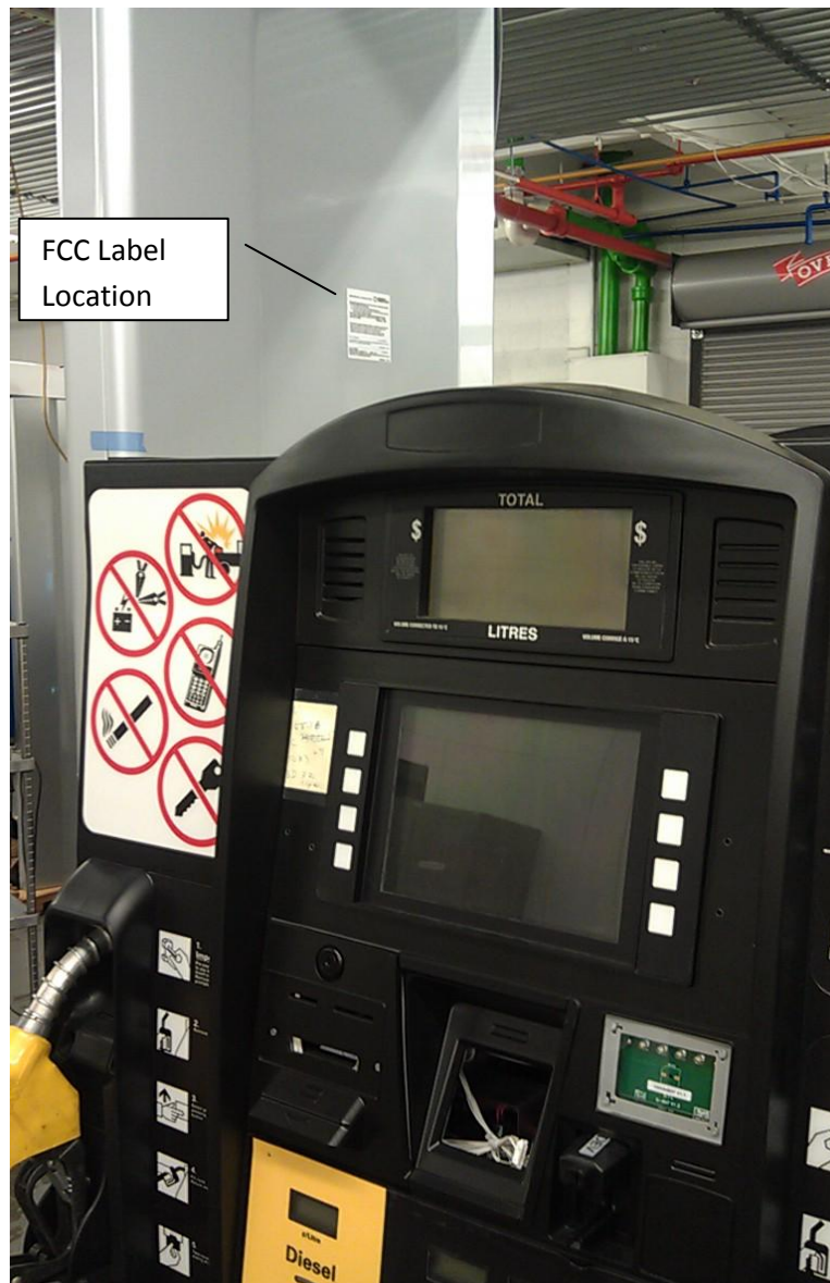
Figure 2 – FCC Label(s) location

Both labels are detailed in the M02962 label drawing. The labels are located on the dispenser exterior inner sheathing as shown in Figure 2