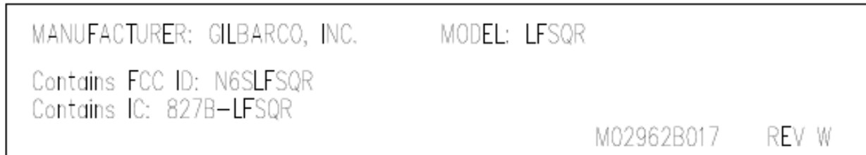
Figure 2: Sample Host Label