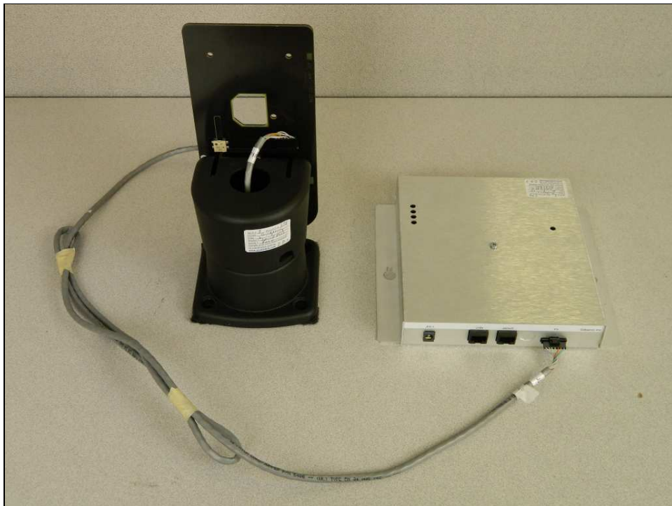
Figure 1: External Photo