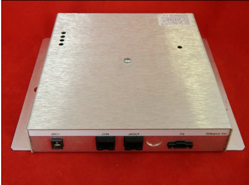
Figure 6: External Photo