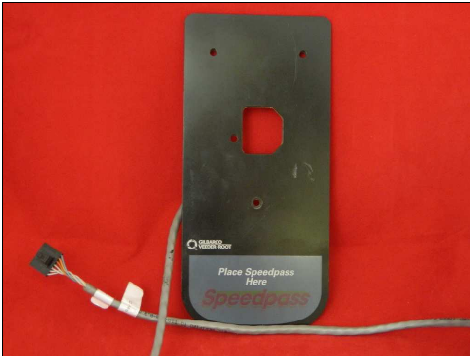
Figure 3: External Photo – C00016-011 “Pin Pad Reader” Antenna