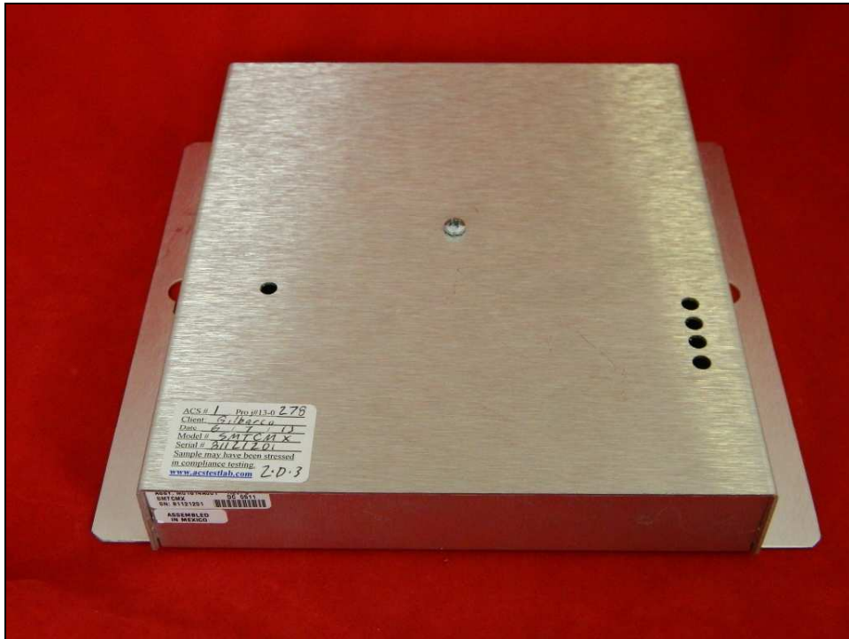
Figure 5: External Photo