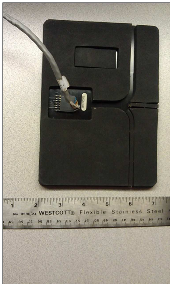
Figure 8: External Photo – C00016-010 “Mini Mat Reader” Antenna Variant