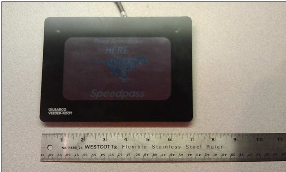
Figure 7: External Photo – C00016-010 “Mini Mat Reader” Antenna Variant