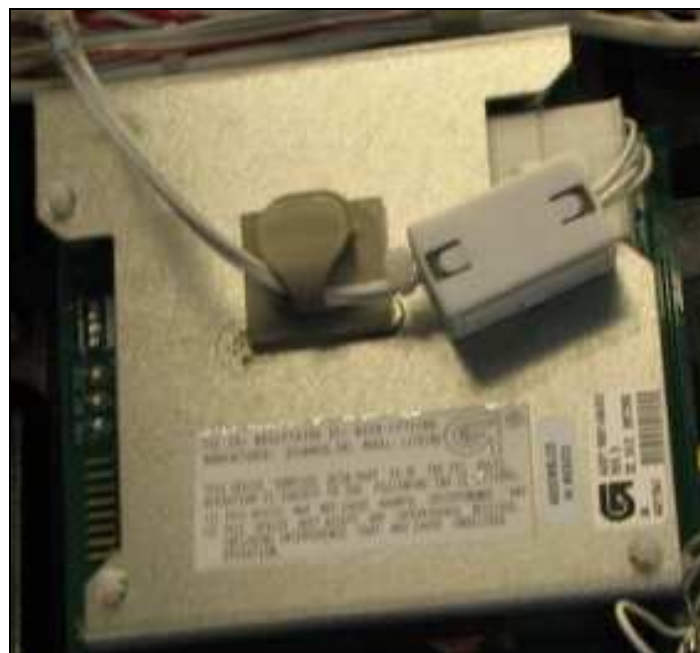
Figure 2: Label Placement