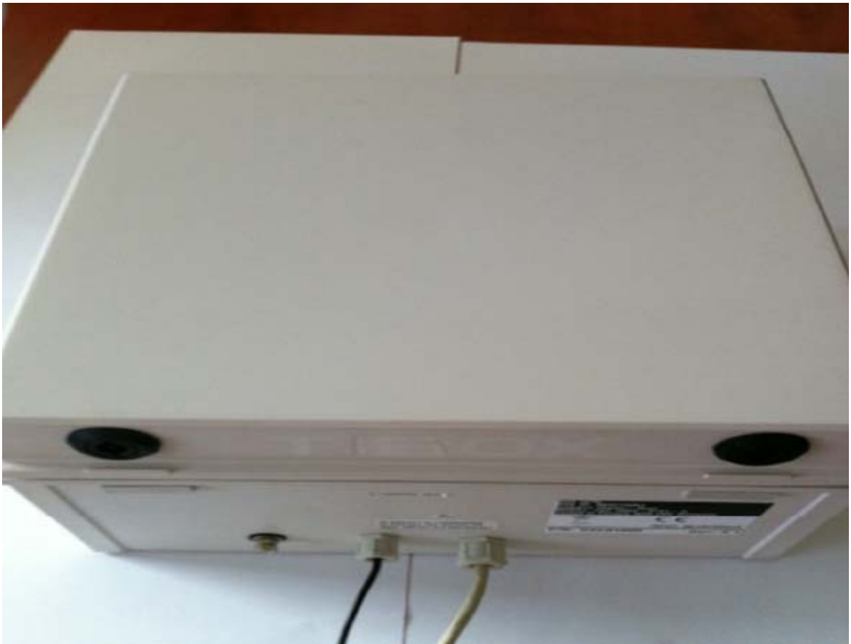
Figure 1: External Photo – General View