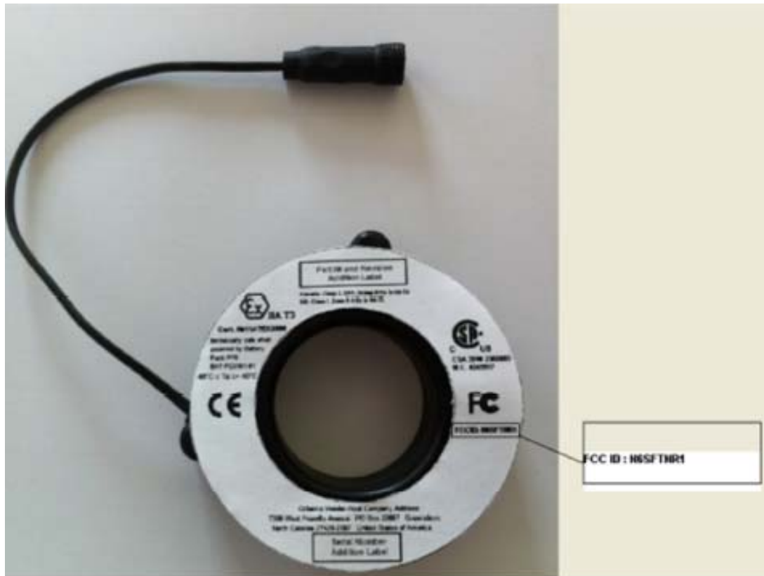
Figure 1: Label Placement