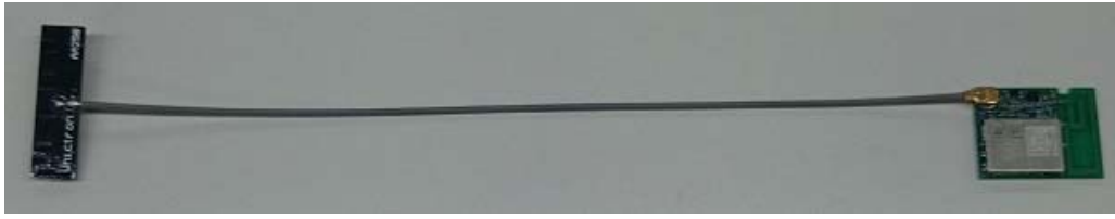
Top with external printed PCB antenna