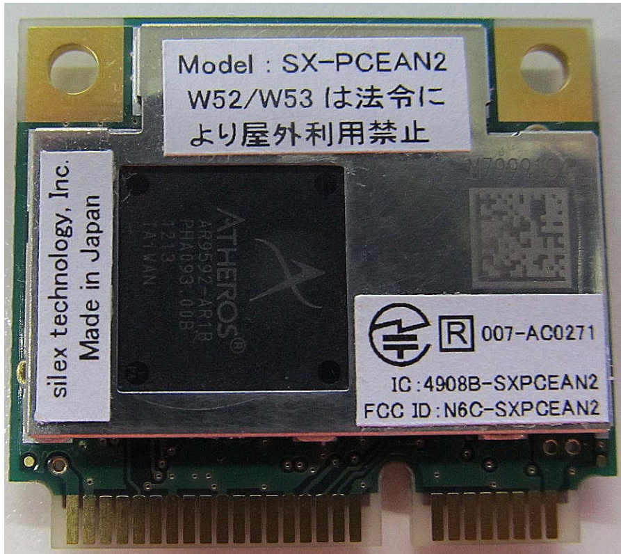
Bottom with shielded