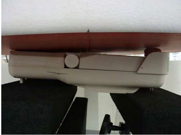
Photograph B1: Body, Front, 0 mm (Front view)