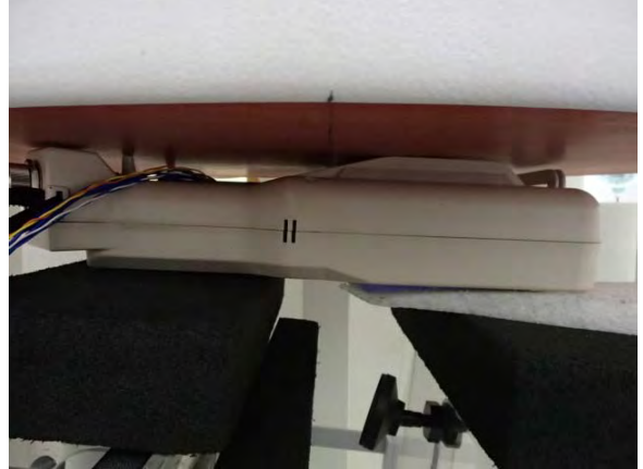
Photograph B3: Body, Rear, 0 mm (Front view)