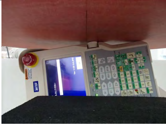
Photograph B9: Body, Left tilt, 0 mm (Front view)