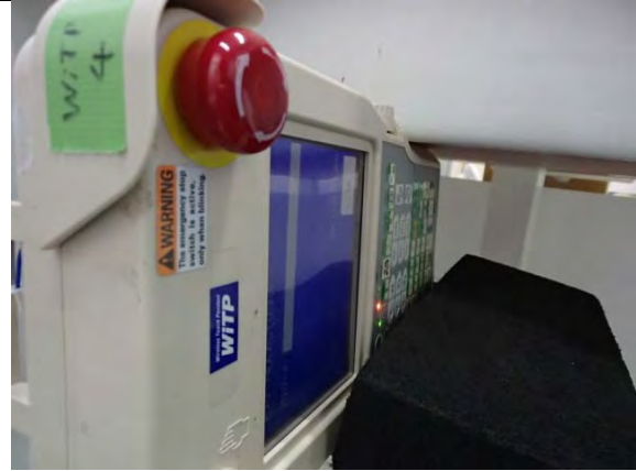
Photograph B11: Body, Left2, 0 mm (Front view)