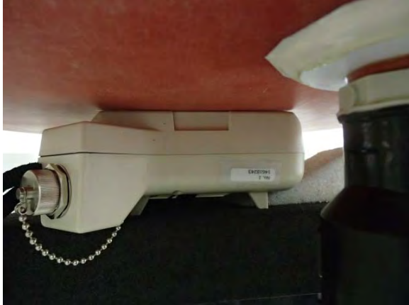
Photograph B2: Body, Front, 0 mm (Side view)