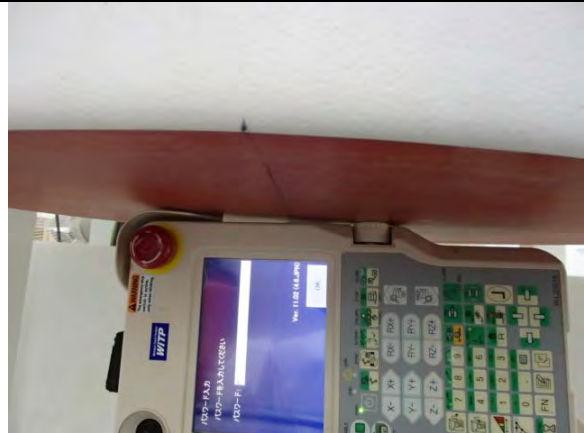
Photograph B7: Body, Left1, 0 mm (Front view)