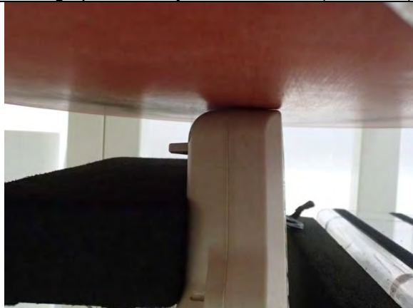
Photograph B6: Body, Bottom, 0 mm (Side view)