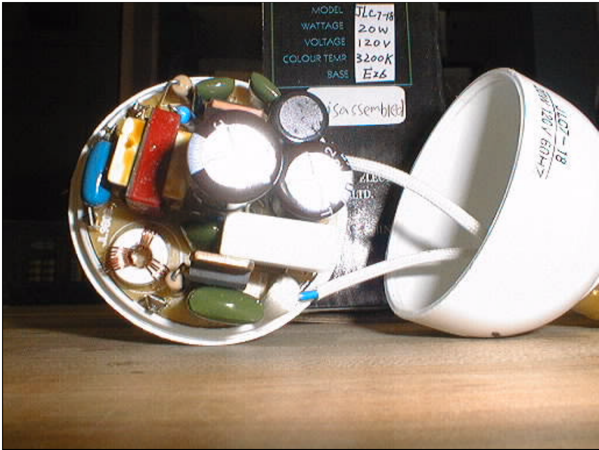
New capacitor C1 installed in Model JLC7-18, top view.