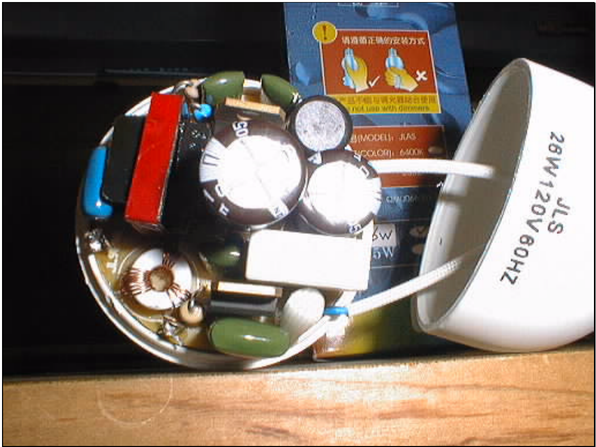
New capacitor C1 installed in Model JLS, top view.