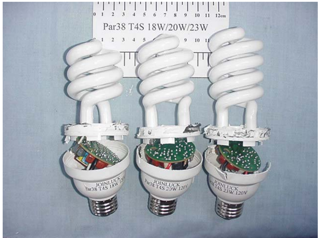
FIGURE 1 ENERGY SAVING LAMP (M/N: PAR38 T4S 18W/20W/23W) COVER REMOVED