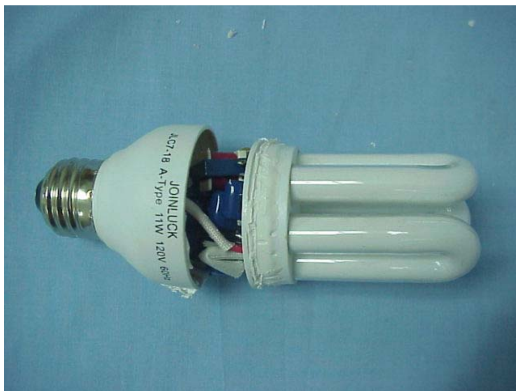
FIGURE 1 ELECTRONIC ENERGY SAVING LAMP (M/N: JLC7-18 A-TYPE 11W) COVER REMOVED