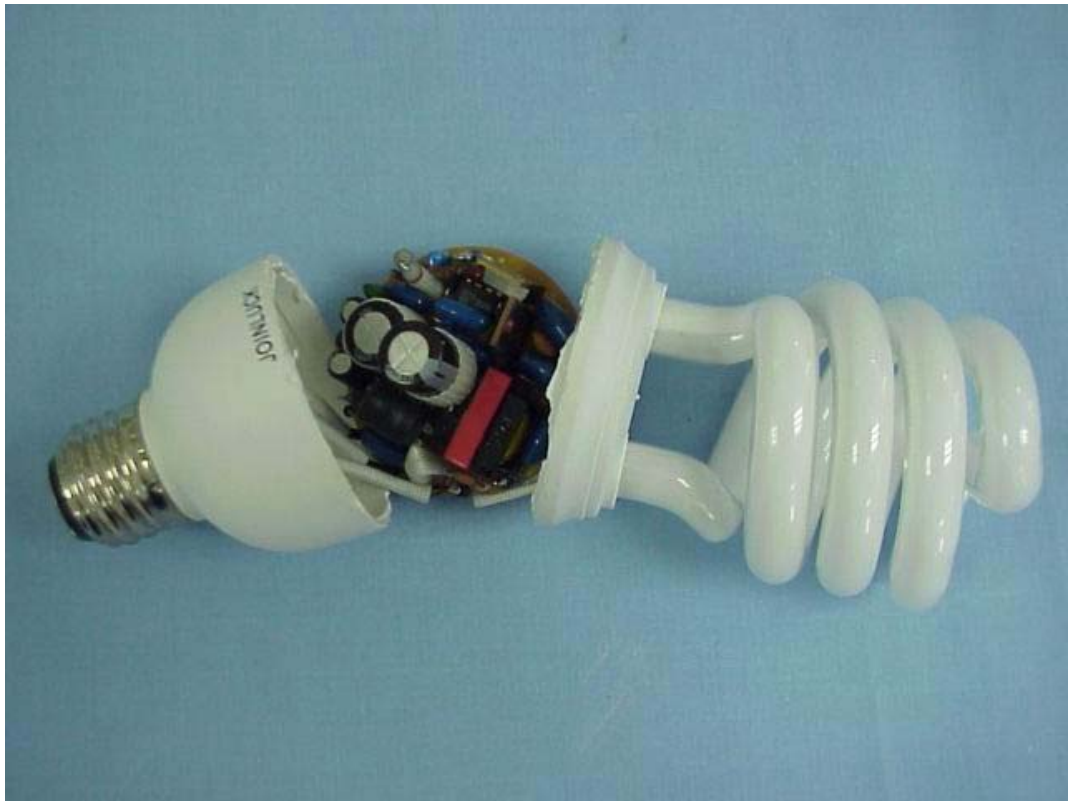
FIGURE 1 ELECTRONIC ENERGY SAVING LAMP (M/N: JLS 3-WAY 12W/20W/26W) COVER REMOVED