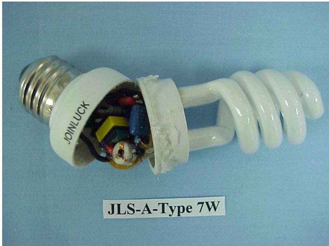
FIGURE 1 ELECTRONIC ENERGY SAVING LAMP (M/N: JLS A-TYPE 7W) COVER REMOVED