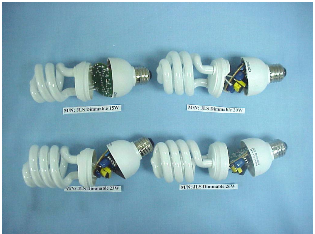
FIGURE 1 ELECTRONIC ENERGY SAVING LAMP (M/N: JLS DIMMABLE 15W/20W/23W/26W) COVER REMOVED