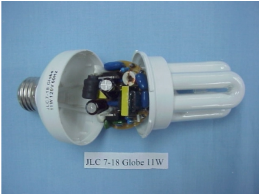
Figure 1 ENERGY SAVING LAMP (M/N: JLC 7-18 GLOBE 11W) COVER REMOVED