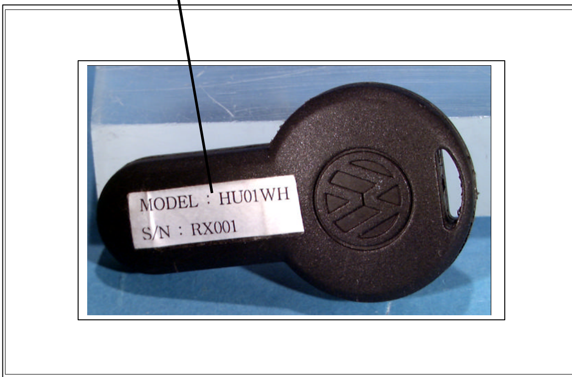
Fig 12. Sample label

The Label shown shall be permanently affixed at a conspicuous location on the device and be readily visible to the user at the time of purchase. Required FCC statement will be placed in the users manual per § 15.19(c) of the FCC Rules.