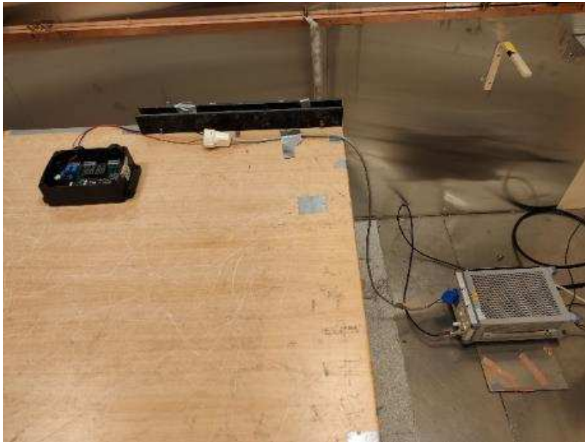
Power-Line Conducted Emissions