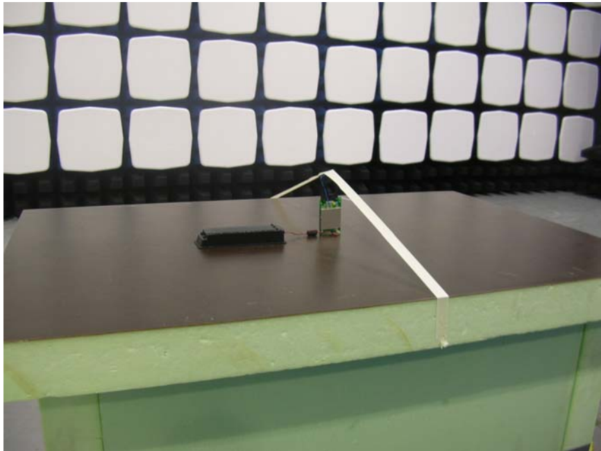
Radiated spurious emission 30-1000 MHz