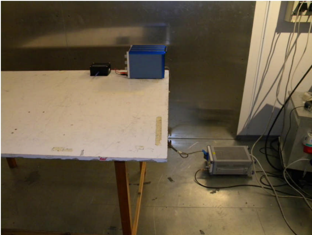
Photograph 3: AC power line conducted emissions test setup, EUT 1