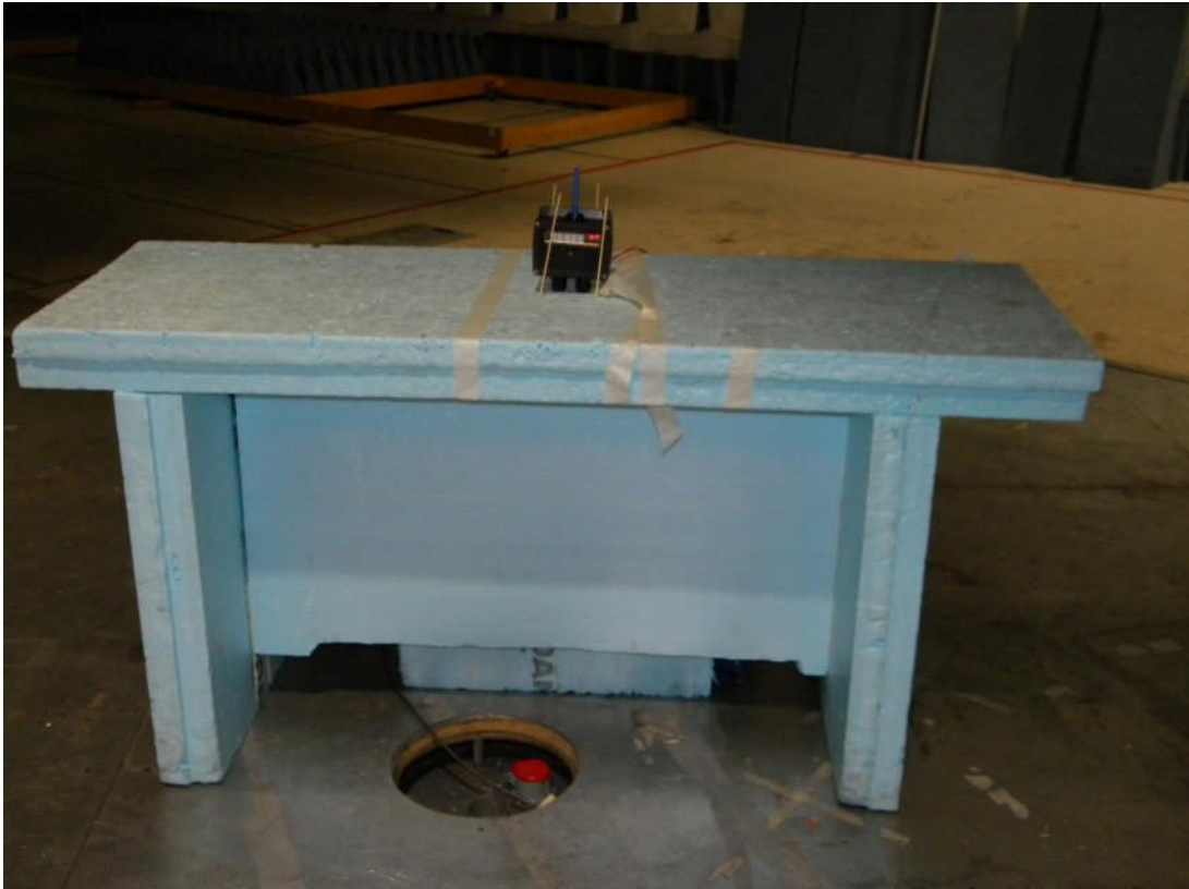
Photograph 1: Test setup, EUT 1