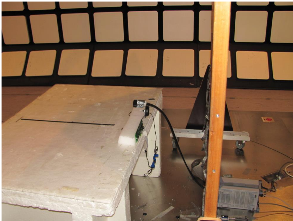
Photograph 2. Conducted emissions at mains ports 0.150 – 30 MHz