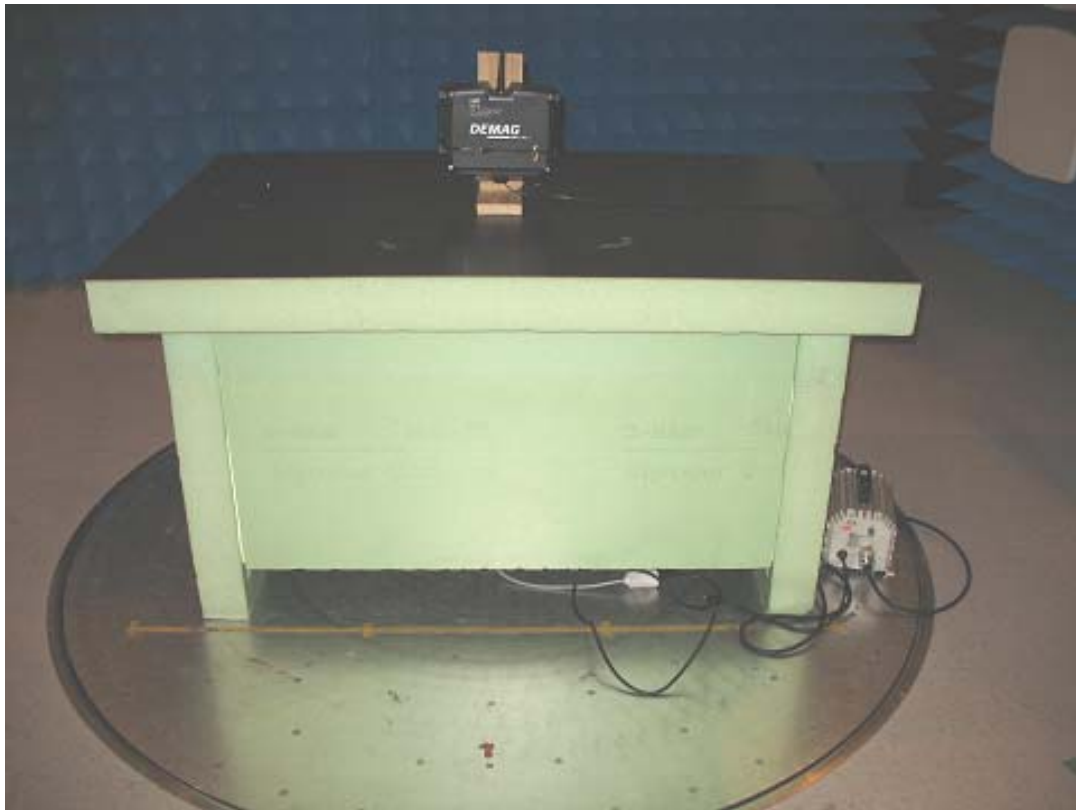
Radiated spurious emission 30-1000 MHz