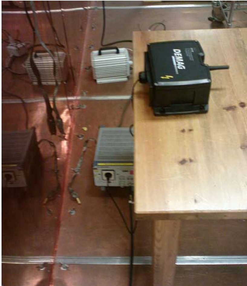
Conducted disturbance voltage in the frequency range 0,15 - 30 MHz