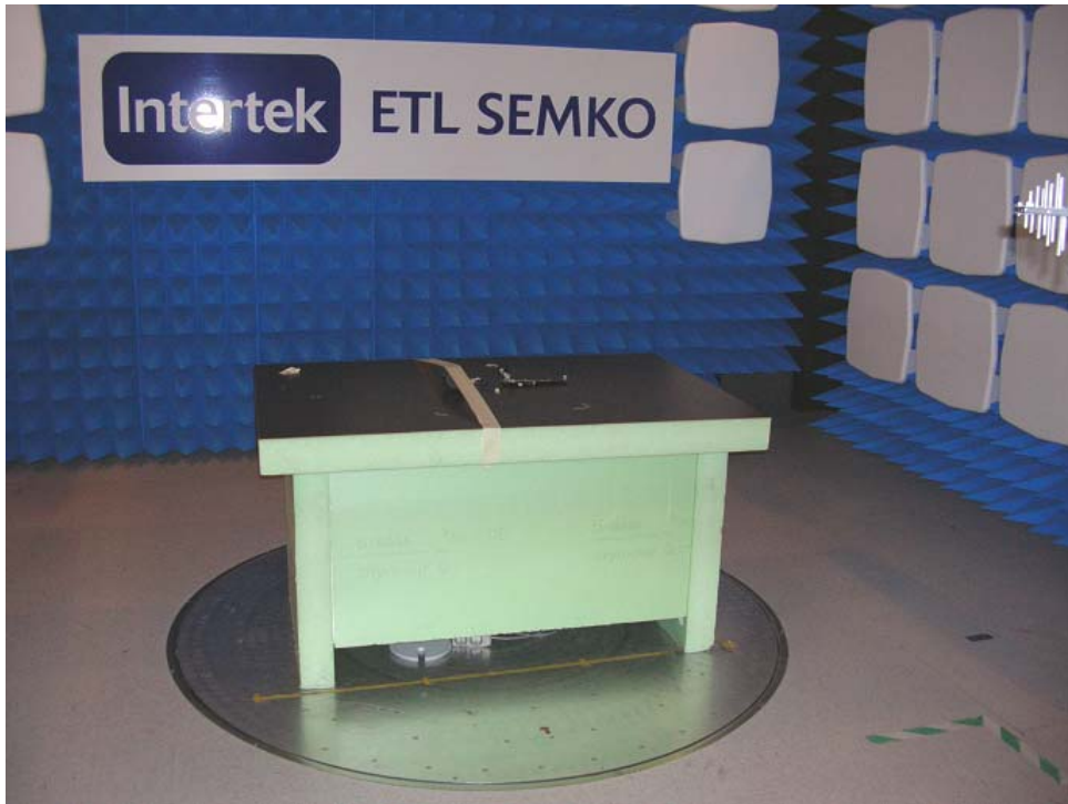
Radiated spurious emission 30-1000 MHz