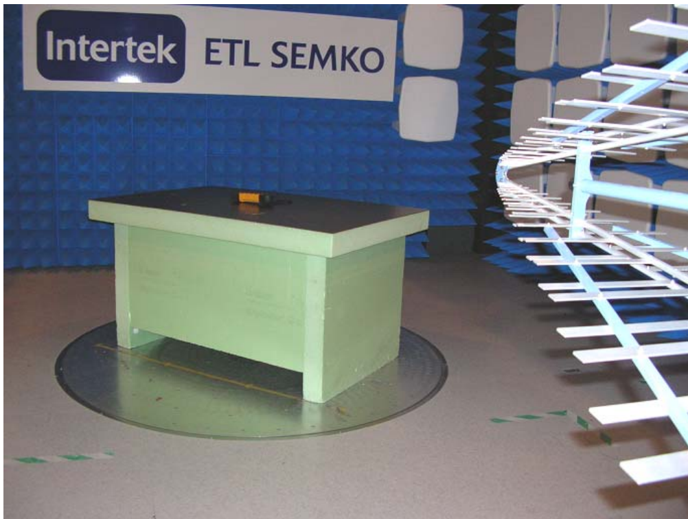
Radiated spurious emission 30-1000 MHz