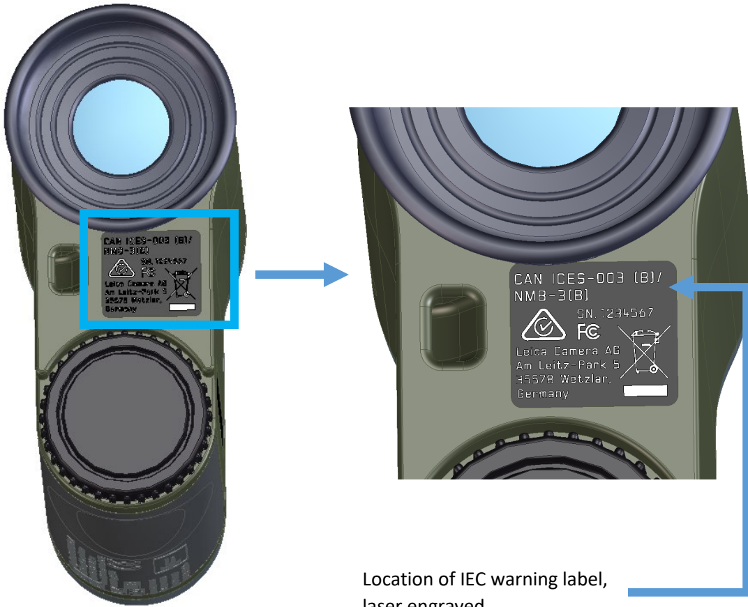
Location of IEC warning label, laser engraved