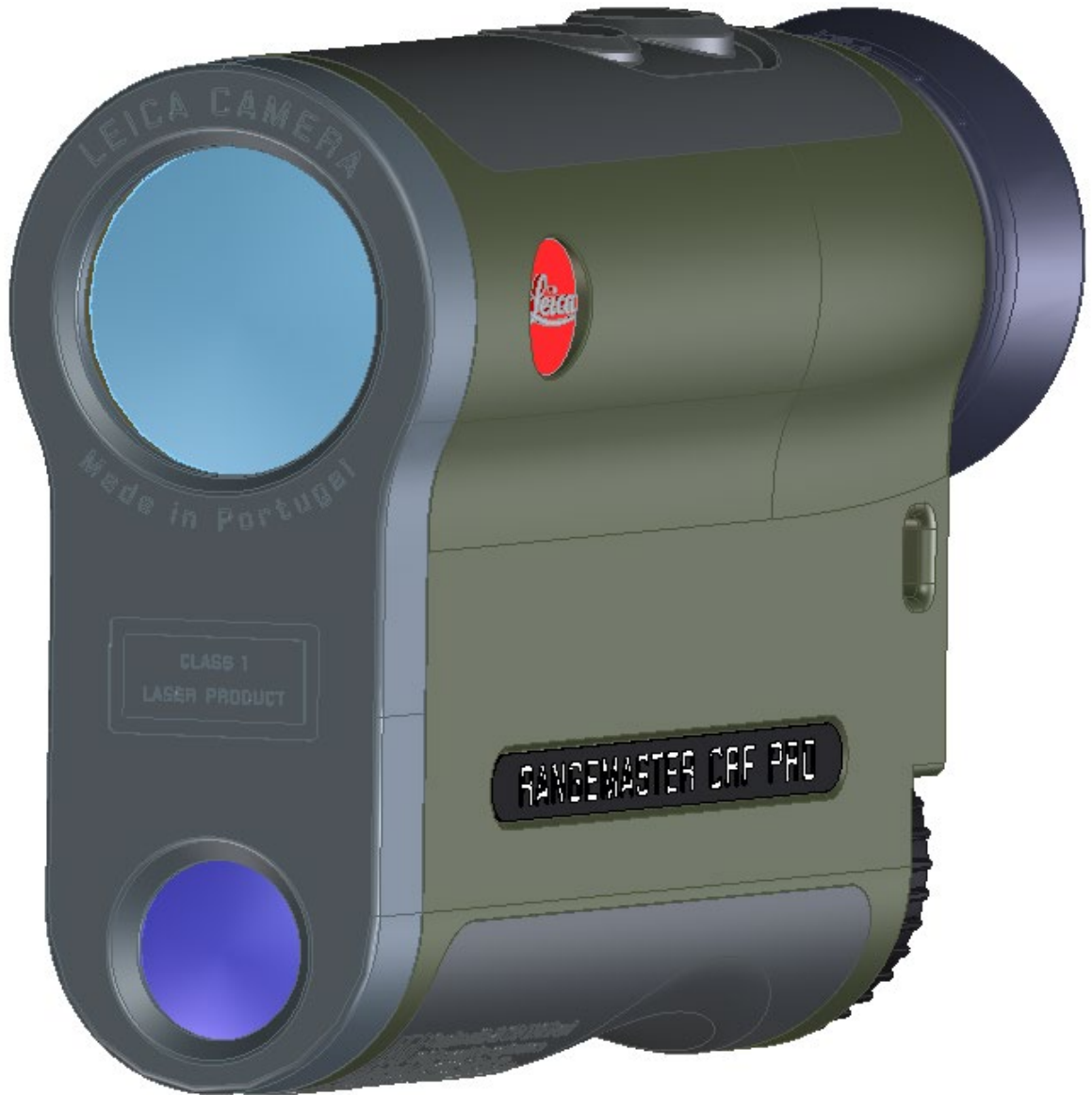
Location of laser warning