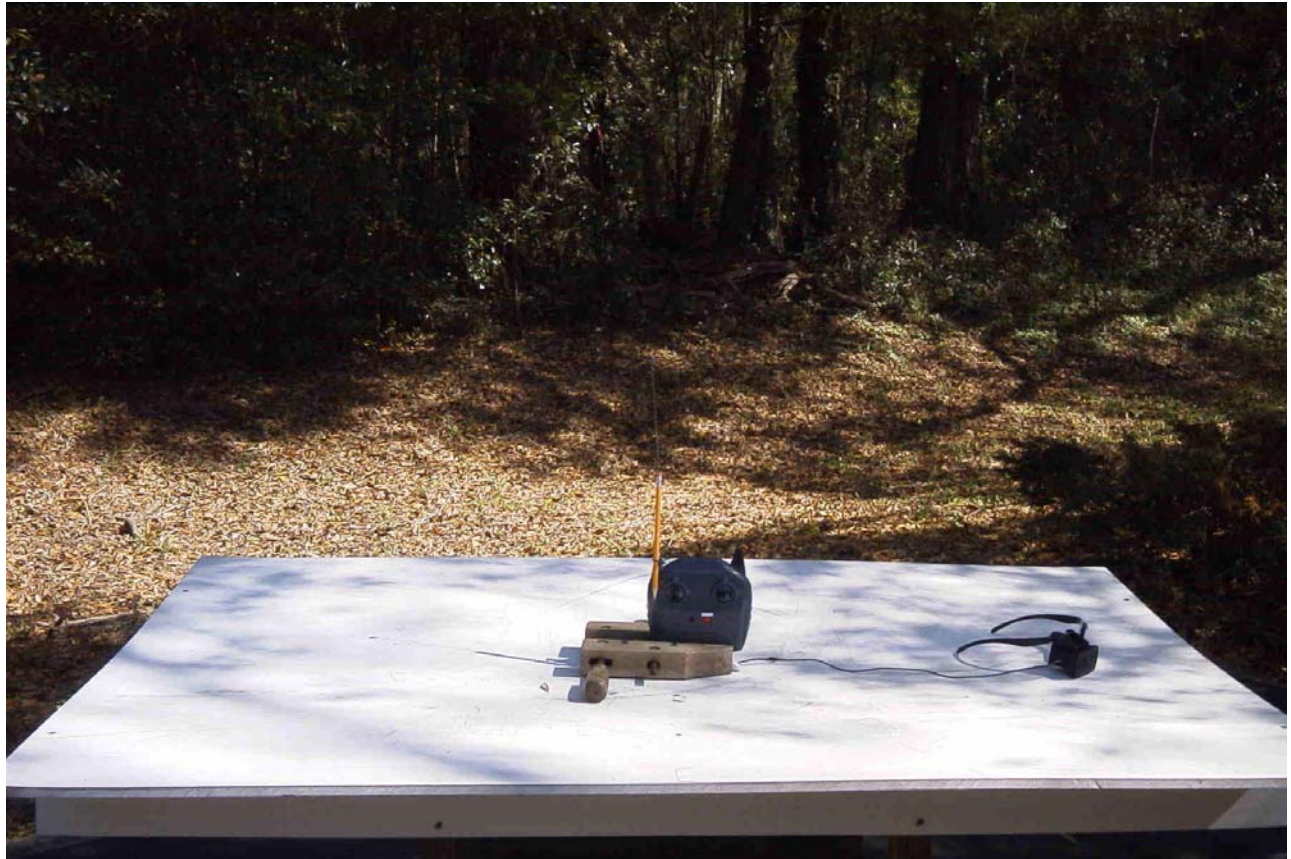
TEST SET UP PHOTO

888.472.2424 F 352.472.2030 email: tei@timcoengr.com