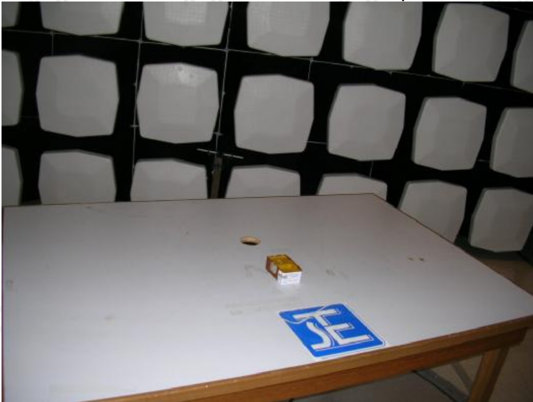
Measurement of Radiated Emission Test Set Up