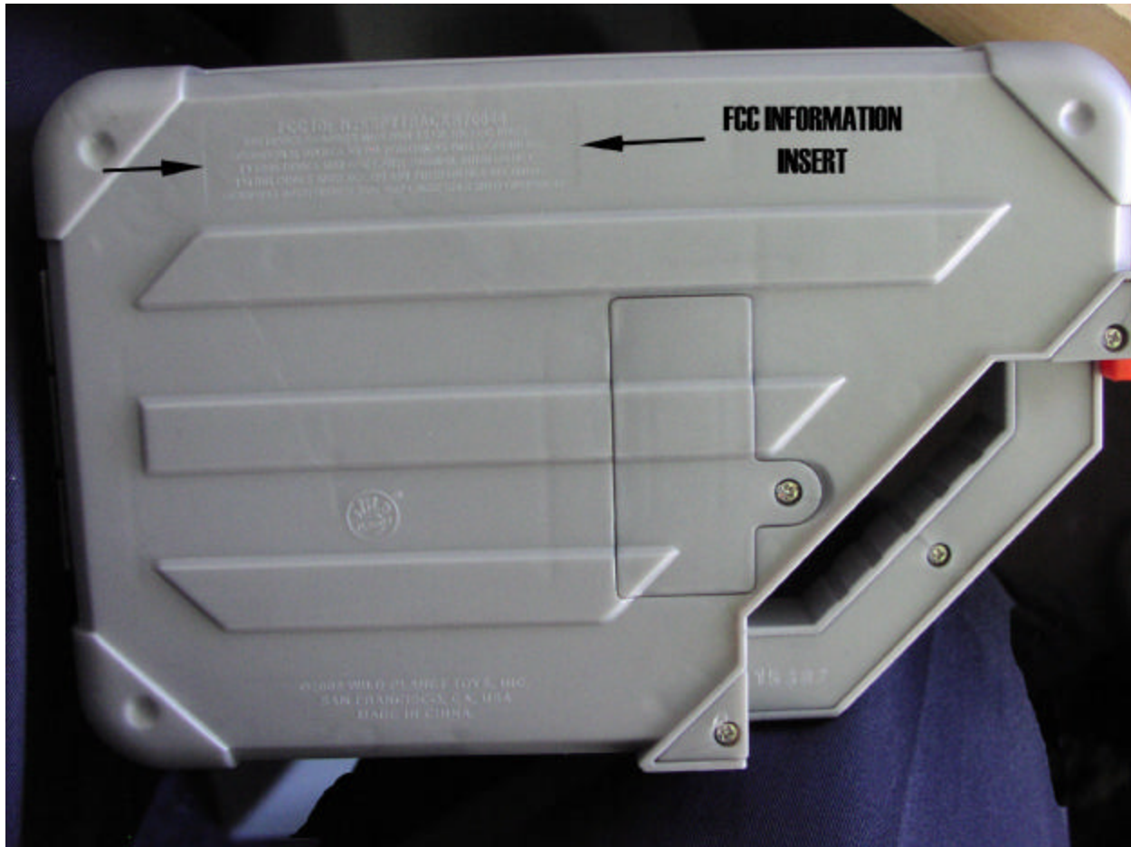
Full Size of the bottom side of the Receiver.

2 The report file is corrupt and cannot be opened by Adobe Reader. Please provide a report that can be opened.