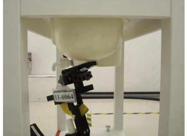
Figure 5. Left Head SAR Test Setup (Tilted)