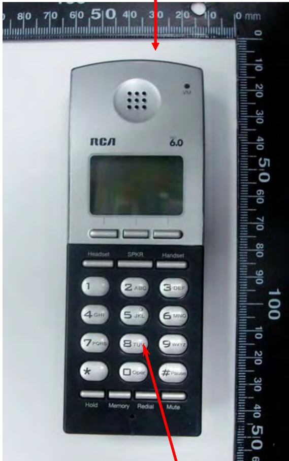
EUT Front side