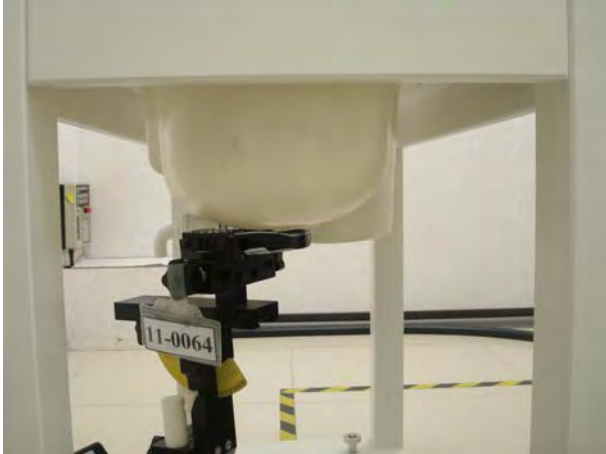
Figure 4. Left Head SAR Test Setup (Cheek)