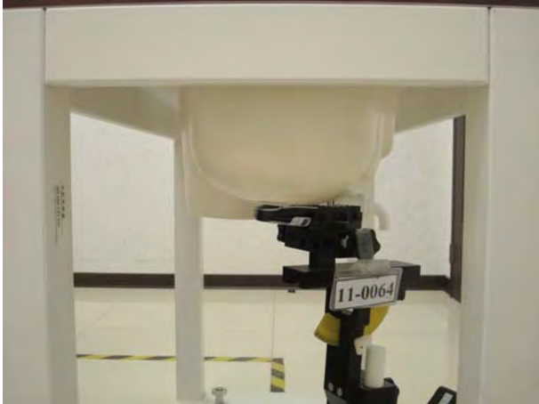
Figure 2. Right Head SAR Test Setup (Cheek)