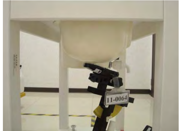
Figure 3. Right Head SAR Test Setup (Tilted)