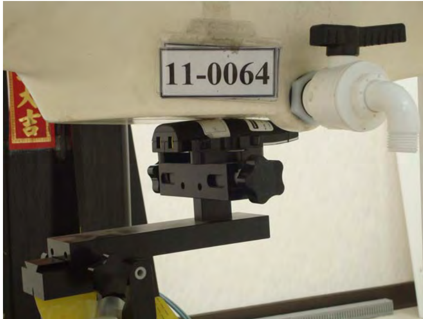
Figure 6. Body SAR Test Setup (Flat Section)