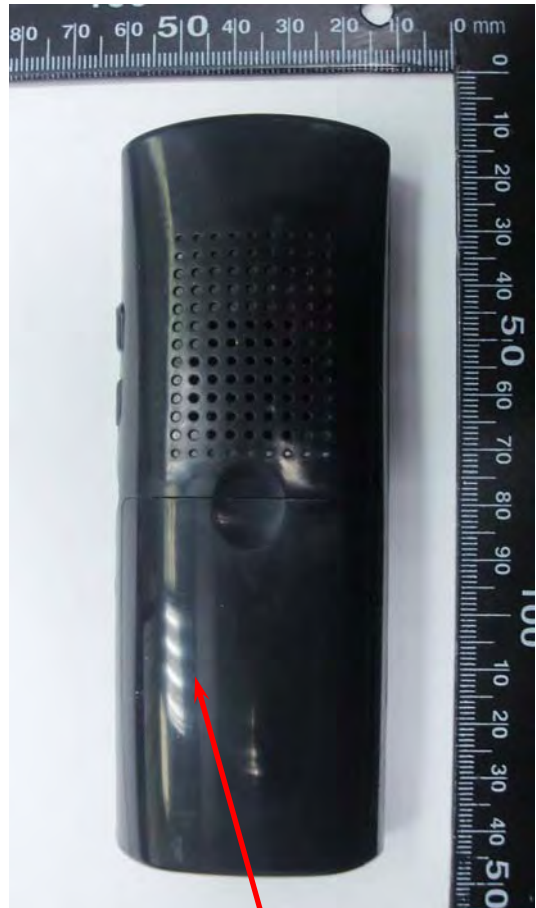
EUT Back side