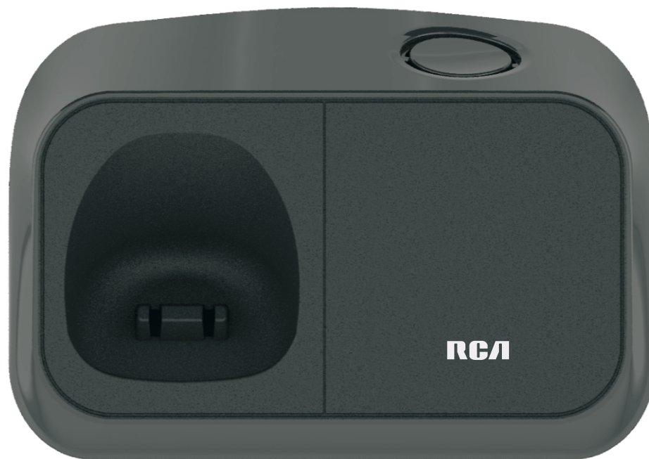
Base top cabinet